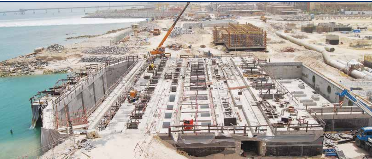
Shuaiba Co-Generation Power/Distillation Plant Project