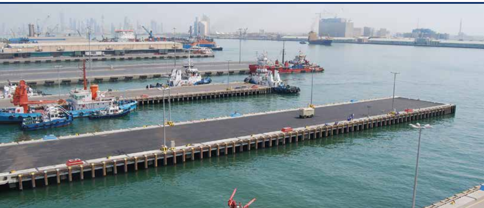
Fishing Berth at Shuwaikh Port, Kuwait