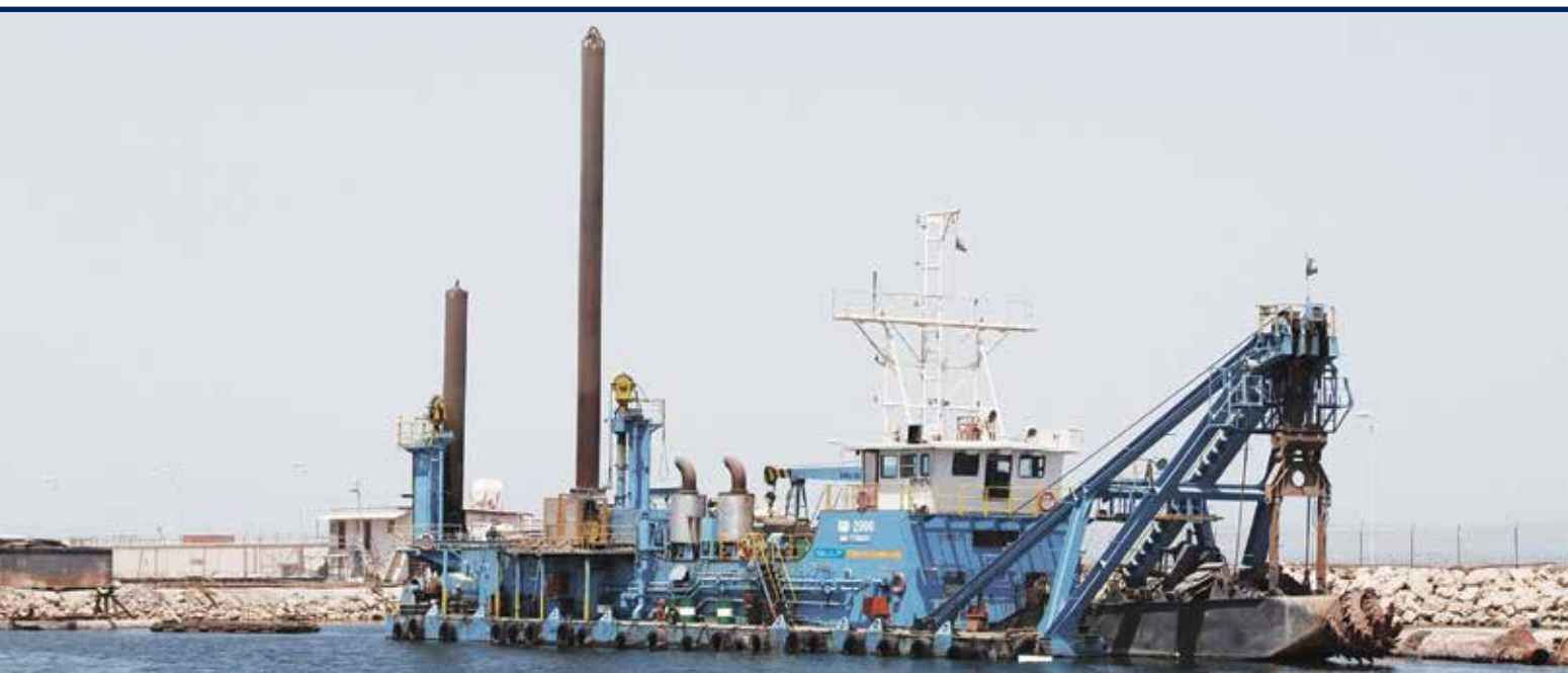
Cutter Suction Dredger

All lifting equipment is computerized, and both lifting equipment and Operators have Third Party Certification.