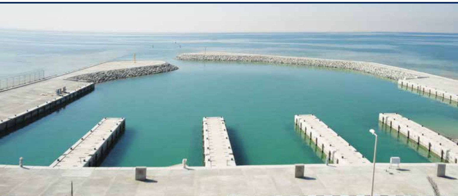
Coast Guard Stations Umm Bab Project - Qatar