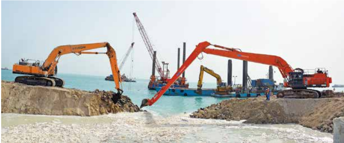
Az zour North (IWPP) Equipment In Action

Gulf Dredging civil works construction equipment includes a wide range of heavy lifting and earth moving equipment, bulldozers, wheel loaders, excavators, dump trucks, auguring equipment and piling rigs capable of driving all type of piles.